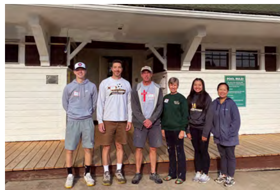
Volunteers from Saints John & Paul's Senior Connection group