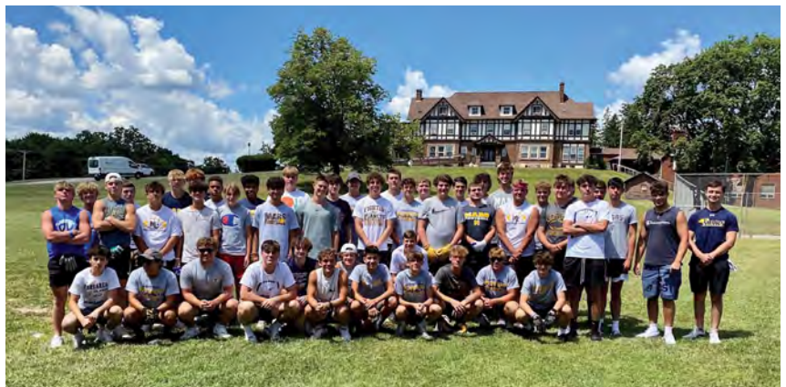
The Mars High School football team