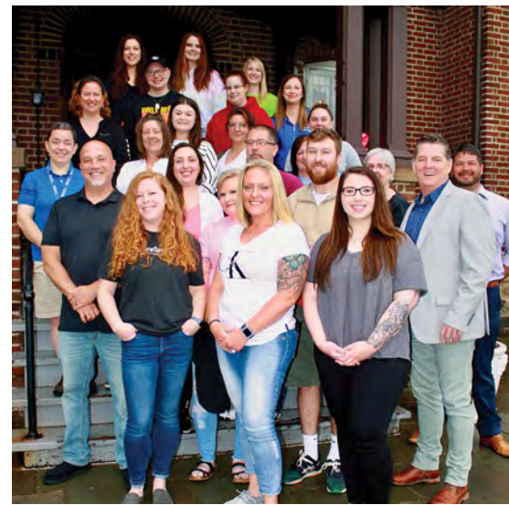
The MST team